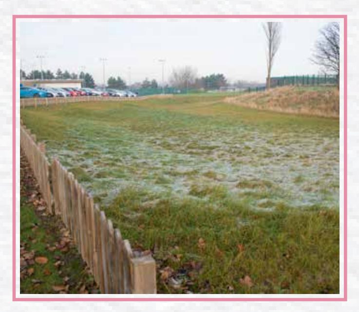
Figure 7: Detention basin within Fellgate Primary School

The total storage volume is 2400cu m with the two schools requesting permanently wet ponds to help develop the educational curriculum. The schools are also participating in the NE "SuDS for Schools and Communities" initiative and have each had rain gardens installed to help mitigate impervious surface run-off and provide permanently accessible learning space.