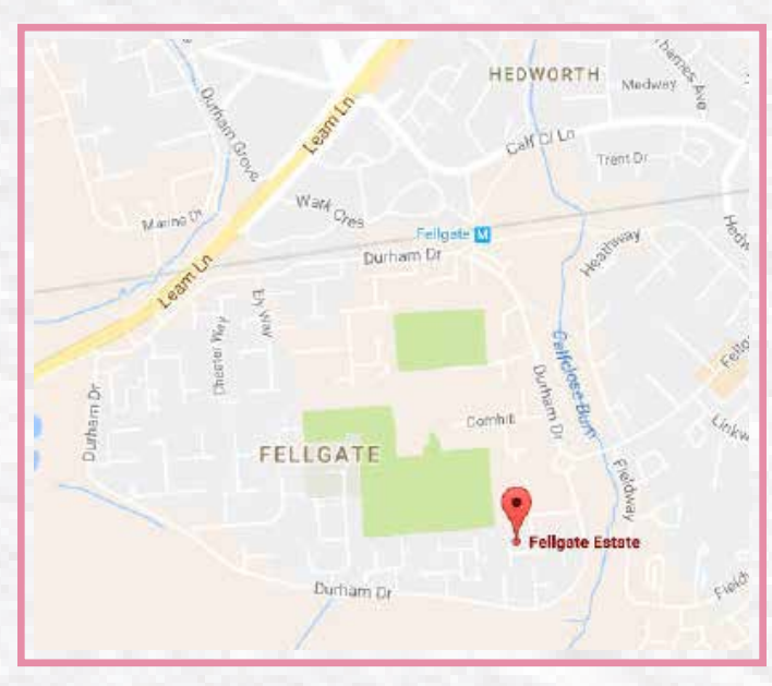
Figure 2: Fellgate Estate Area

The estate also contains two schools which have around 8.5ha of playing fields. There is a SW-NE gradient across the estate as it falls towards the River Don which flows into the River Tyne some 2 miles to the north.