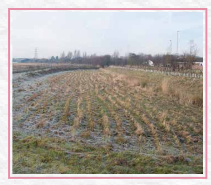
Figure 4: Detention Basin 1