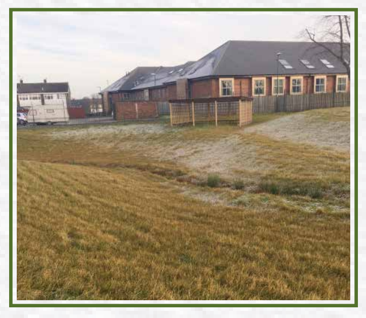
Figure 9: Basin and pond in St. Joseph's RC School