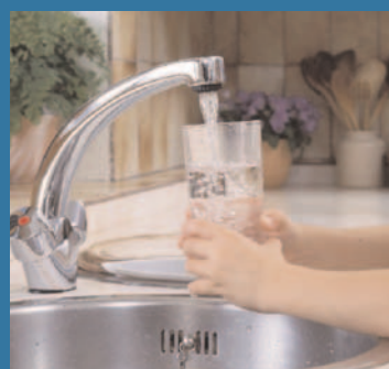
Clean water to your home

Now the water is clean and safe to drink and can be sent down the water pipes to our homes, businesses, leisure centres, etc.