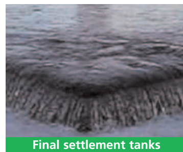
Final settlement tanks

Water from a river, reservoir or from underground is pumped into the treatment works. If it is from a river or reservoir it may contain leaves, branches, rubbish or dead insects, fish or even animals. The first job is to remove these things from the water. We use screens made from metal with holes in that allow the water through but not the rest. The water then goes into large storage tanks.