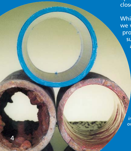
The pipe on the left is a typical furred up pipe before it has been improved. A relined pipe is pictured on the right with a new one on top.

Whichever method we use, we will warn you in advance, provide alternative water supplies where requested and disinfect the pipes on completion. Streets and paths will be resurfaced and returned to normal.