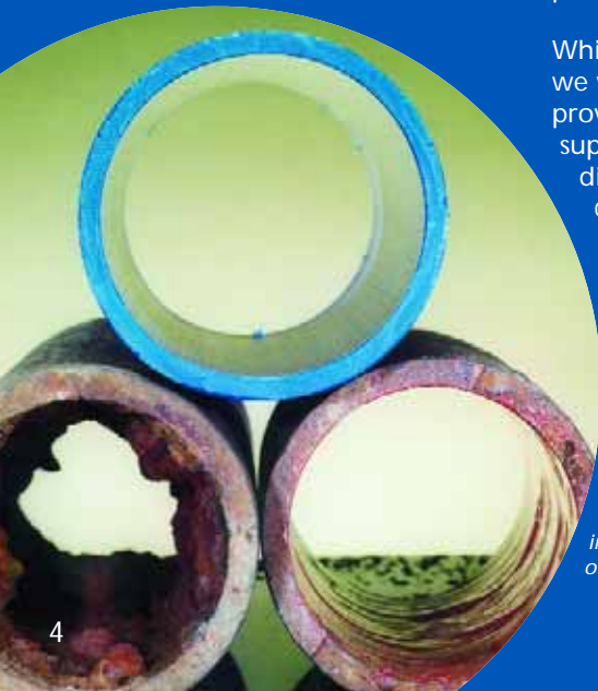
The pipe on the left is a typical furred up pipe before it has been improved. A relined pipe is pictured on the right with a new one on top.

Whichever method we use, we will warn you in advance, provide alternative water supplies where requested and disinfect the pipes on completion. Streets and paths will be resurfaced and returned to normal.